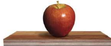
负离子地板上的 苹果完好无缺 Apple on IONWOOD floor (with negative ions) No sign or rotting