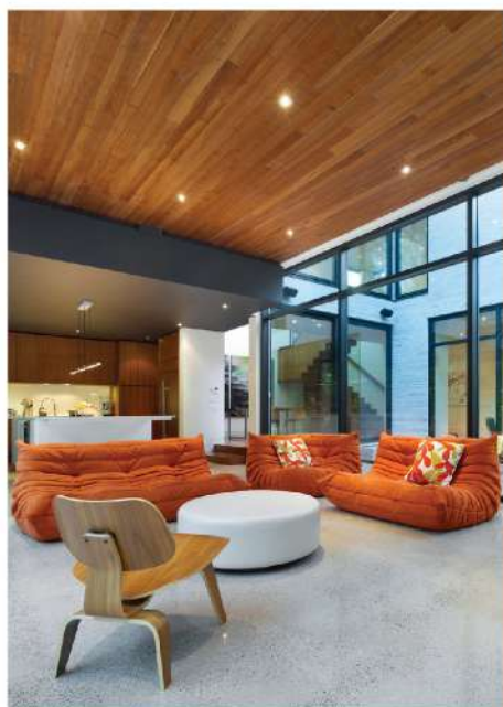
多层实木复合天花板 Solid Engineering Ceiling