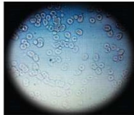
处于负离子的环境中 20分钟后, 红血球呈正常。 Blood cells return to normal after 20 minutes in an environment filled with negative ions