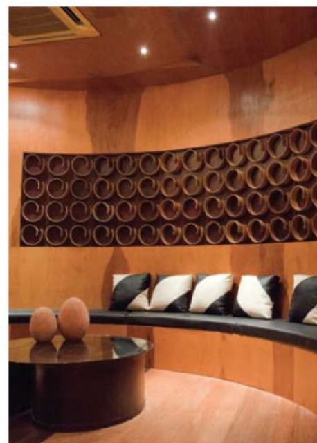
多层实木复合弯曲板 Solid Engineering Flexi-Plywood