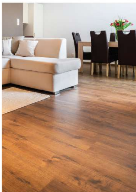
多层实木复合地板 Solid Engineering Wood Flooring