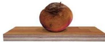
非负离子地板上的 苹果已经腐烂 Apple on normal floor (no negative ions) Rotted

Experiment Done On Apple (Antioxidant) After 1 Month